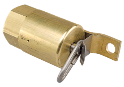
Figure 17. Pressure Operated Trip

The pressure operated trip, is connected to the distribution piping and utilizes agent pressure for actuation. The agent pressure displaces a spring-loaded piston to disengage a holding ring from the stem connected to the piston.