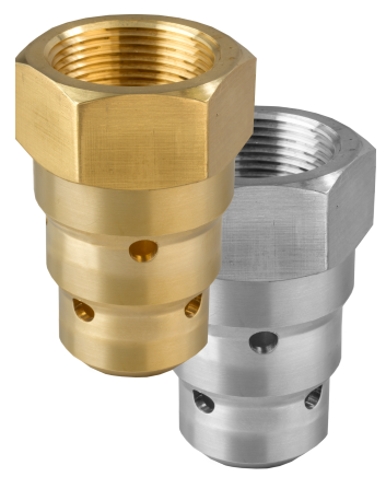
Figure 13. ECS-500 Nozzles (Brass or Stainless Steel)

The ECS-500 and ADS hardware includes nozzles with 360° and 180° discharge patterns which can be mounted in either upright or pendant style. The number and size of the orifice on each nozzle is custom calculated using the Flow Calculation Software Suite version 4.0 and higher.