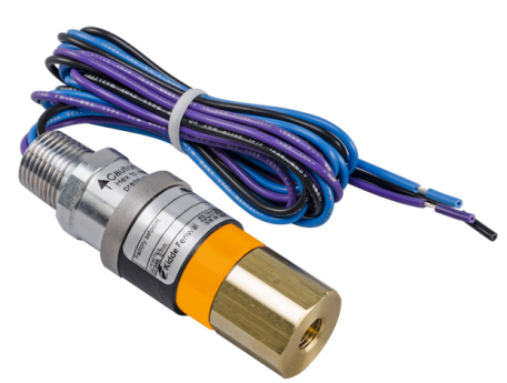
ECS-500 Agent Supervisory Pressure Switch

Cylinder supervisory pressure switches are intended to detect a fall in pressure in a clean agent or Nitrogen filled driver cylinder. The cylinder supervisory pressure switch can be wired for either normally open or normally closed operation, depending on installation requirements.