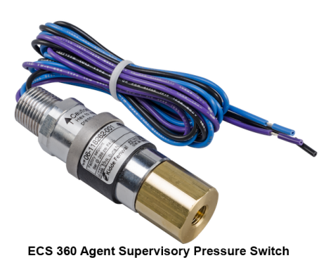
Figure 4. Cylinder Supervisory Pressure Switch