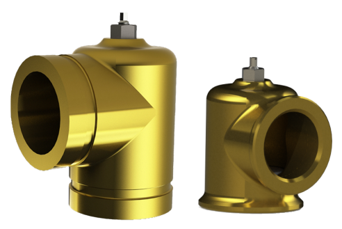
Figure 7. Manifold El-Check Valve

Note: El-Checks are to be installed at system manifold in vertical direction.