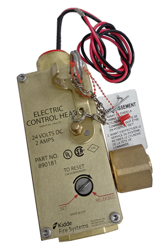
Figure 5. Electric Control Head