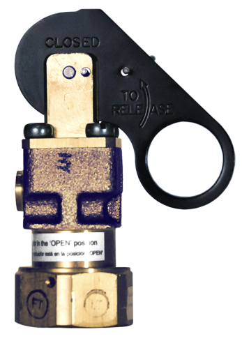
Figure 6. Lever or Pressure Operated Control Head