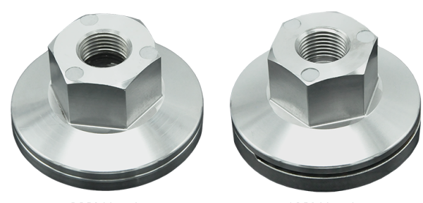
360° Nozzle 180° Nozzle Figure 14. ADS Nozzles (Stainless Steel only)