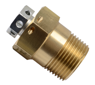
Figure 15. Safety Outlet

Safety Outlets are designed to protect against over-pressurization in closed sections of discharge pipework, i.e., manifolds. The hardware offer includes a Safety Outlet rated for agent pressures and one rated for Nitrogen pilot line pressures.