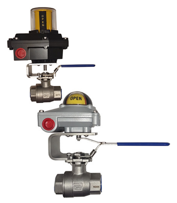
Figure 12. Lockout Valve

Lockout valves can be installed at the end of the manifold or, if a common manifold protects multiple hazards, downstream of each selector valve. Lockout valves include a limit switch. The limit switch must be wired to the control panel to indicate a trouble if the valve is closed.