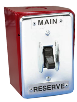
Figure 18. Main and Reserve Transfer Switch

The main & reserve transfer switch, is installed on systems having main and reserve cylinders. Placing the switch in either the "main" or "reserve" position provides uninterrupted fire protection capability during system maintenance or in the event of a system discharge.