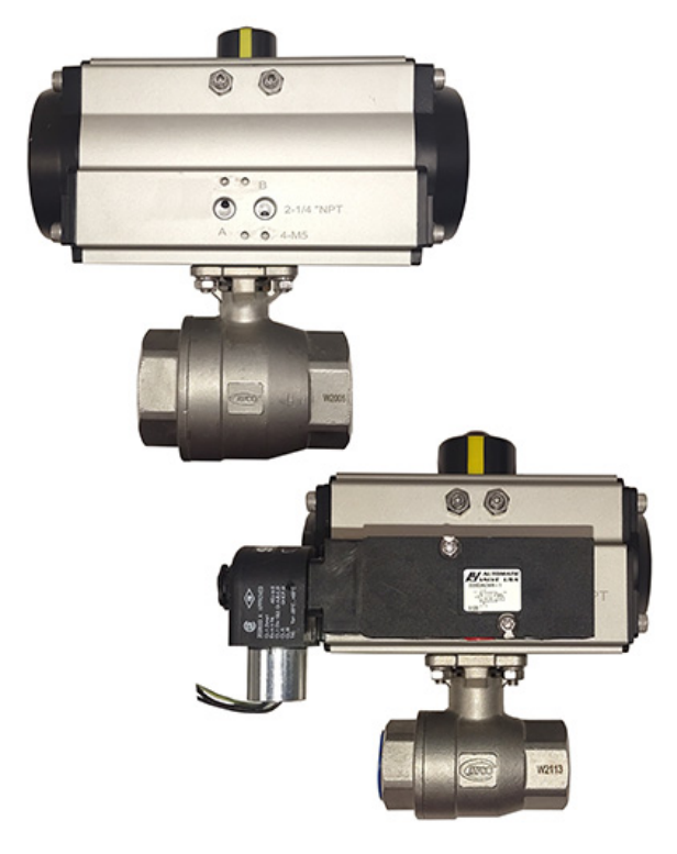
Figure 11. Selector Valve

In multi-hazard applications, selector valves route agent from a central cylinder bank to the specific hazard where fire has been detected. Selector valve actuators operate pneumatically using agent pressure routed from the manifold via a pressure regulator on the back-plate manifold and the respective back-plate solenoid valve.