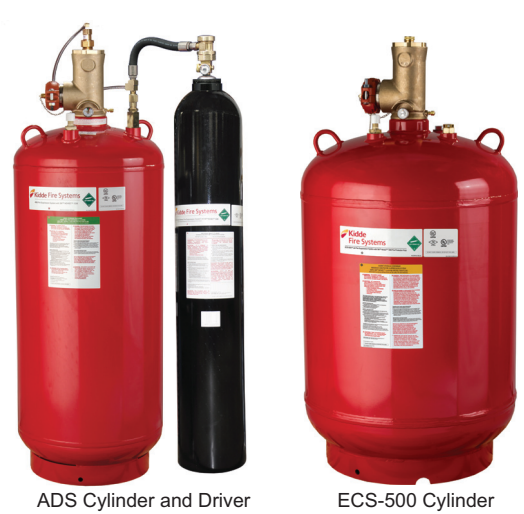
Figure 2. Cylinder/Valve Assemblies

When shipped, cylinder-valve assemblies include an anti-recoil cap and a Safety Transport cap as a safety feature designed to prevent uncontrolled, accidental discharge.