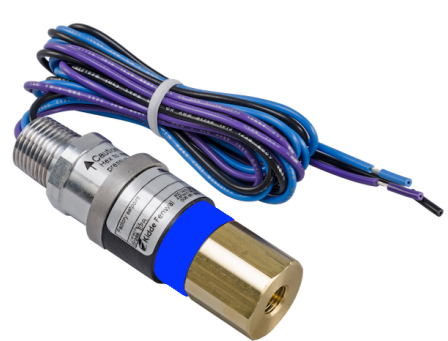
Nitrogen Pilot/Driver Supervisory Pressure Switch