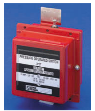
Figure 16. Pressure Switch

The pressure operated switch uses the pressure of the discharging agent for activation and must be connected to the distribution piping. The agent actuates a pressure operated stem which toggles the electrical switch. Each switch can also be operated manually by pulling up on the stem. These switches are used to annunciate alarms, shut down ventilation, and turn on electrical automatic dampers or other electrical equipment. Each pressure switch must be manually reset, by pushing down on the stem to return the switch to the set position. The minimum operating pressure required is 50 PSI.The toggle on the pressure switch can be set to either N.O. to close or N.C. to open contact transfer upon operation.